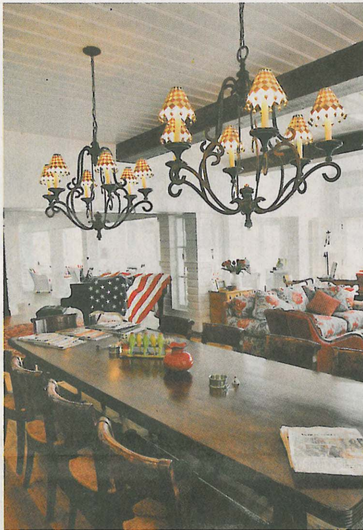
The open kitchen and living room are separated by a long dining table that can seat the Nashes' sizable family.